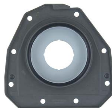
Audi A1-7, S1/3, Q3/5, TT/S Crankshaft Seal Rear: OSS0507