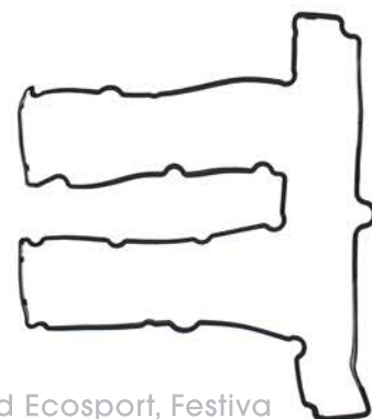
Ford Ecosport, Festiva EcoBoost 1.0 Rocker Cover: RC3508