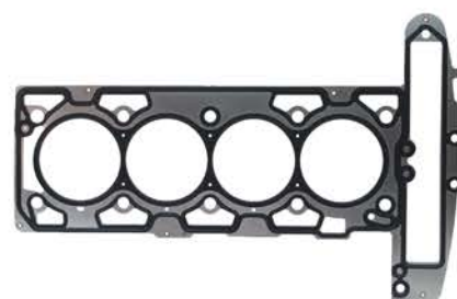
Holden Captiva LE5 / 9 Head Gasket: S5620SS