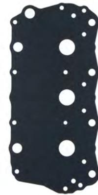
Landrover Freelander 25K4F Rocker Cover: RC3235