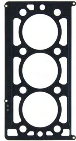
Landrover Freelander 25K4F Head Gasket: S2266SS