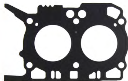
Subaru Forester Impreza Liberty FA20