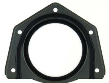
Saab 9-3 Z19DTH Crankshaft Seal Rear: OSA0025