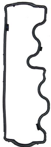
Holden Astra AH Rocker Cover: RC3522